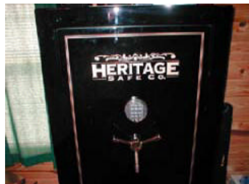
The Heritage T3060 "Tradition Series" safe is designed to hold up