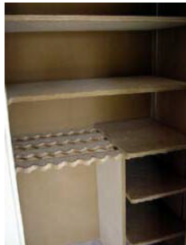
The Heritage Model T4072 "Tradition Series" safe is designed to hold up to 52 long guns.